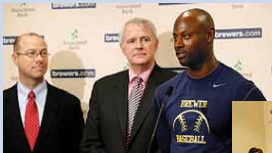
Left: Milwaukee Mayor Tom Barrett (middle) at a Milwaukee Brewers charity event

based organization programs that help participating fathers attain a GED and find employment, with fatherhood programming tailored toward the needs of young fathers and those who have been involved in the criminal justice system.