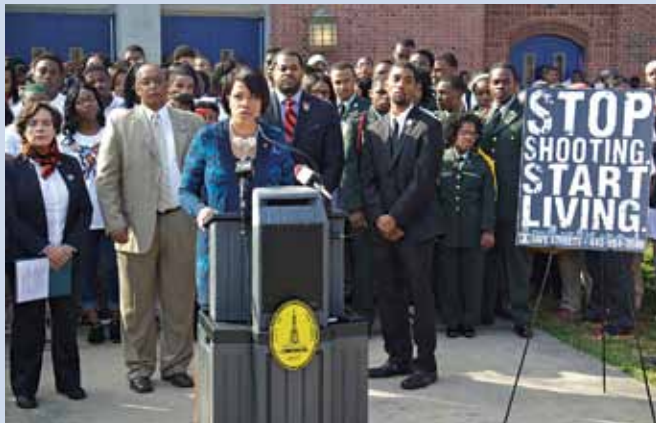
Baltimore Mayor Stephanie Rawlings-Blake speaks at the kickoff of the city's Safe Streets initiative, one of many local efforts that are improving outcomes for black males in Baltimore.

“We have forged a strong partnership between our public school system and workforce development agency to create innovative learning environments – like the one at the Baltimore City Career Academy – that not only provide effective academic instruction, but also hands-on employability skills development and real-world work experiences. In particular, these partnerships are yielding positive results for many young, African-American males who might otherwise not have had a ‘second chance’ to earn a high school diploma or be given the opportunity to move along a sustainable career pathway.”